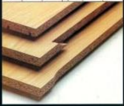
LACH DIAMANT at LIGNA 1979