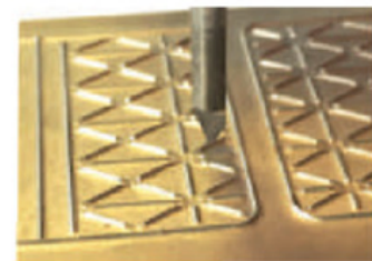
engraving of flexible die

LACH DIAMANT offers PCD- and CBN-tipped engraving tools in standard or customized dimensions as semi-finished or finished (incl. side-cut) with highest reachable surface qualities Made in Germany .