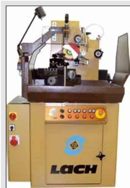
Precision grinding machine, model »pcd-100« with rocker for grinding PCD/PCBN inserts and diamond grinding wheel.

Now, we know what happened next: When all attempts of trained natural diamond cutters failed, it was up to a resin bond diamond grinding wheel, mounted on a simple carbide and steel grinding machine, to conquer this new material, even though it was time-intensive to do so.