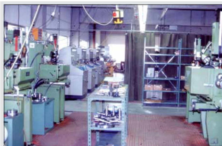
A look inside: Part of the production area for diamond tools for wood and plastic materials, in use since 1984. Clearly visible in the front, the vertical eroding machines - In the back, machines of the first generation of the M-900 series for spark grinding of Straight-edged diamond tools.

The further development of NC and CNC machine technology made diamond tools worldwide indispensable for the wood and composite processing industry, the beginning of a triumphal success; but I will cover this in one of the next editions.