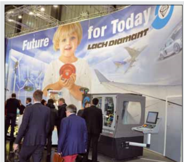
"EDG-Plus spark grinding" demo on a »Dia-2200-mini« at GrindTec 2018.

"rotation eroding!" And therefore, the birth of the electrical discharge grinding procedure – that is "EDG."