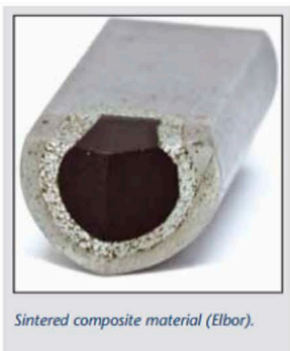
Sintered composite material (Elbor).

Everyone was convinced that the Volkswagen group would now become the most important facilitator of the planned modernization of the East German automobile industry. Up to this point, both Wartburg, produced in Eisenach, and Trabi, produced in Zwickau – still featuring two-stroke engines – were completely out-of-date: Low performance, excessive fuel consumption, in addition to a negative environmental impact.