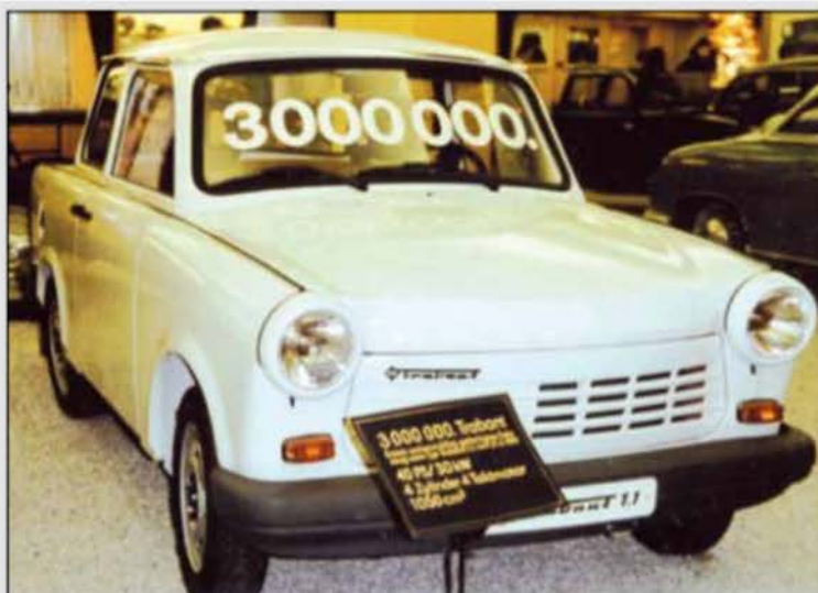
The 3-millionth Trabant with four-cylinder engine (photographed in August 1990 at Horch Museum in Zwickau).

Just a few years ago, there was a discussion whether East Germany (GDR) had invented the VW Golf, which, however, is not true (Focus 10/2014). At the end of the 1980s, there were only approximately 200 cars per 1,000 residents; in the West were twice as many. It is not surprising that in 1977, the SED (Socialist Union Party of Germany) regime decided to buy 10,000 VW Golfs. VW CEO, Tony Schmücker, hoped for on-going business and follow-up orders. That was not the case.