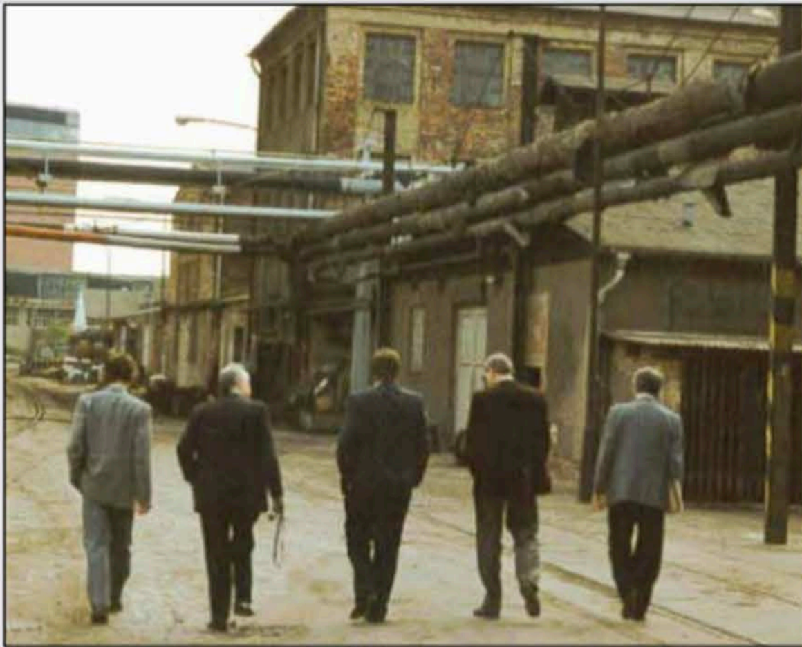
Visit of GDR facilities during the "after-the-wall" transition period, e. g. Reick plant for abrasives in Dresden.