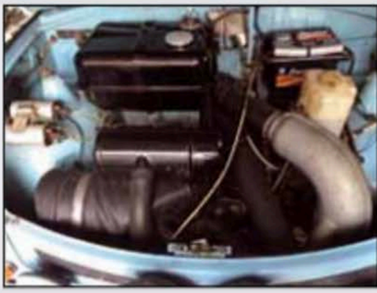
A view into the interior of a Trabi.