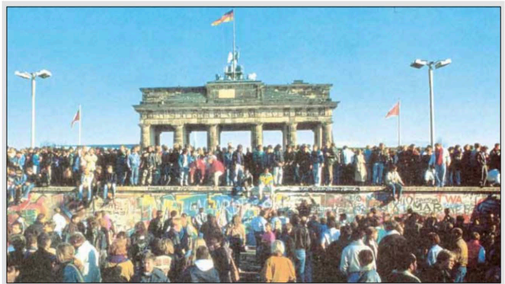
The fall of the wall – November 9th, 1989.

This was another area where carbide tools had been the dominating tool used for wood and composites, with very few exceptions such as diamond trial tools, delivered by tool manufacturer Ledermann & Co.