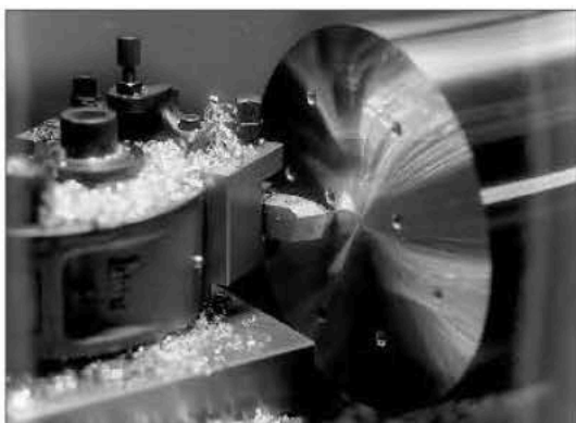
The world's first presentation of a PCD turning steel during turning aluminium part with a simulated interrupted cut

The Hanover Trade Show would start on April 26 th , 1973. A new cutting material meant another chance to showcase another innovation, like Borazon™, as one of the first com-