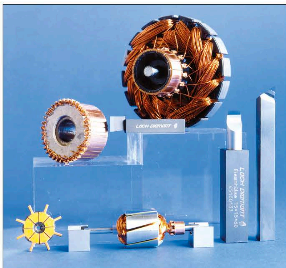
First PCD tools used in production of copper commutators at Kautt & Bux

* This "poly – poly – or what?" series will be continued with further highlights in hpt 2/2019.