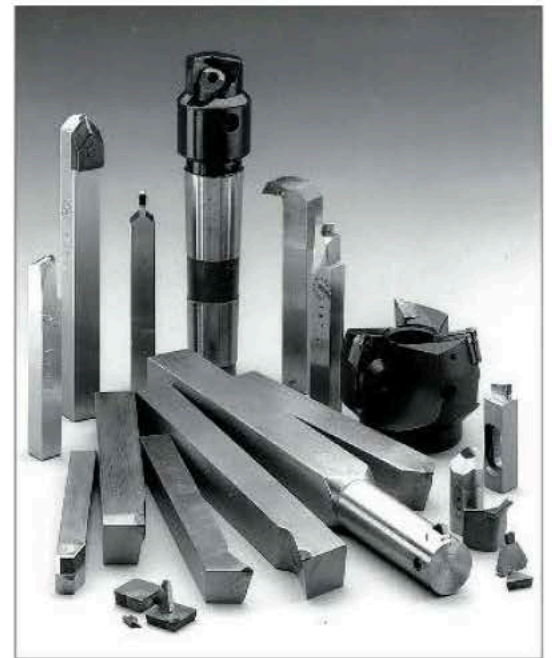
Successful polycrystalline diamond tools of the first hours – examples (1973 - 1974)

production and service of natural turning diamonds for customers like Bosch, AEG, Siemens, Menke and others. Should we now switch completely to synthetic diamond blocks? We would have to find new customers in order to stay profitable. But how and where? At the time, the only way to find new potential customers was via the ABC of German Industries, a handbook of national companies.