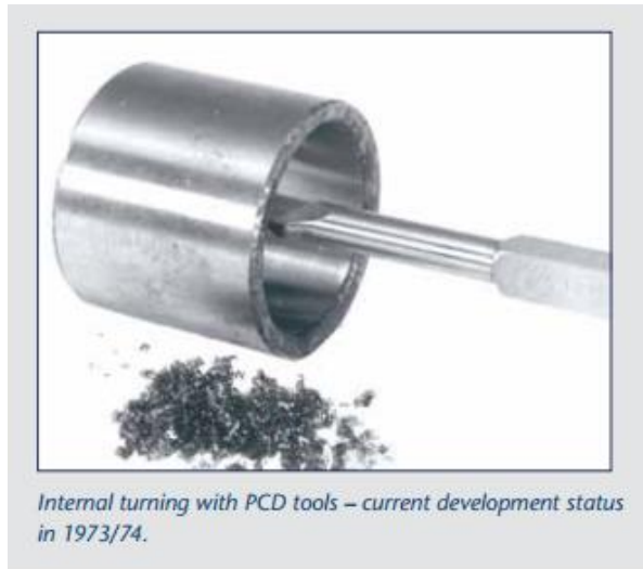
Internal turning with PCD tools – current development status in 1973/74.

Looking back, many new and unusual applications were added within a short period of time, e.g. the Dutch manufacturer for meerscham pipes who could now produce the mouthpiece faster and more precisely. As a thank you, he brought his latest pipe selection to each trade show for several years – which was a special delight to our sales