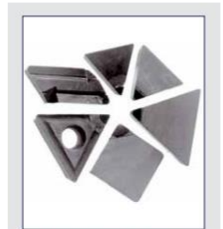
First PCD cutting inserts – made in 1973/74.

The industrial revolution, starting in England around 1770, and its powerful continuation in Germany in the mid 19 th century would not have been possible without diamonds. They were instrumental especially for the production of steam engines and locomotives. More precise grinding machines, studded with wheels for steel grinding, had to be developed, and without diamond dressing tools, only geometrically distorted surfaces would have resulted. The demand for natural diamonds from Brazil and Africa skyrocketed during the following 100 years – and gained strategic importance due to both world wars. There was an increased need and desire to grow diamonds or to produce synthetic diamonds in order to