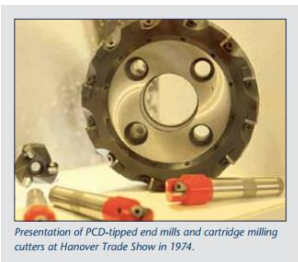
Presentation of PCD-tipped end mills and cartridge milling cutters at Hanover Trade Show in 1974.