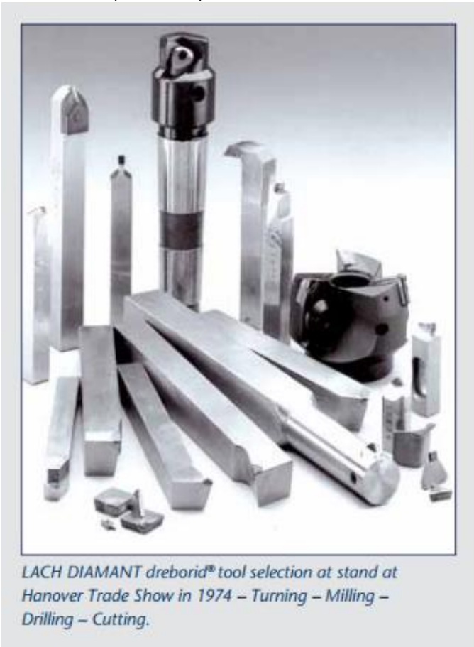
LACH DIAMANT dreborid® tool selection at stand at Hanover Trade Show in 1974 – Turning – Milling – Drilling – Cutting.

At that time, the grinding wheel production moved into a neighbour building, a large facility which happened to become vacant, and stayed there until 1984 when we moved to Donastrasse in Hanau.