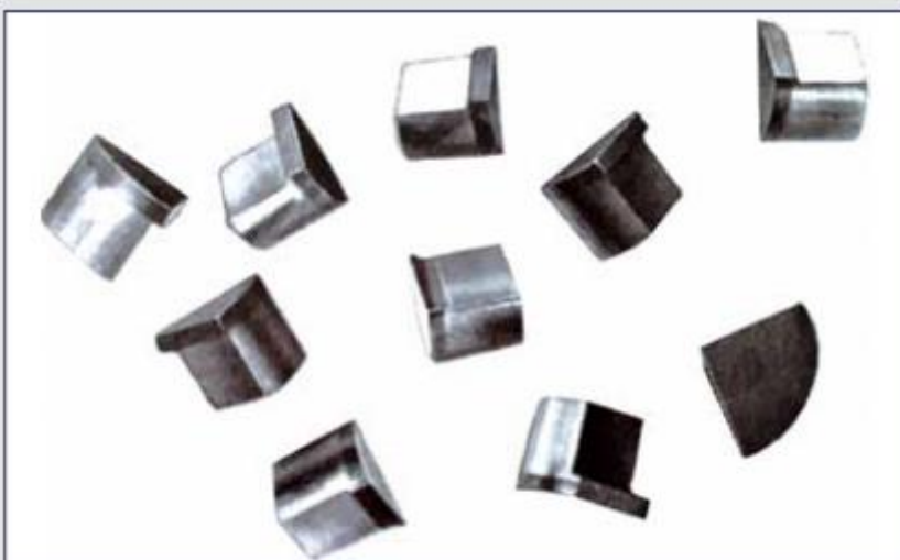
Crude composite cutting inserts.

Once again, it was Tracy Hall who - in 1967/68 - implemented the idea to bake very fine diamond grains with carbide as a carrier material during synthesis. He was successful: The first step towards a so-called polycrystalline synthetic diamond cutting material had been accomplished. EDG (Electrical Discharge Grinding for dividing the round plates which at first had a diameter of approximately 3.2 mm) had not yet been discovered. Therefore, the carbide had to be scored with electro-plated diamond cutting