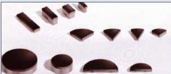
Selection of polycrystalline diamonds. (Development stage. 1982).

They must have been very disappointed when I had to tell them about three weeks later that we would use not a CBN material but a polycrystalline