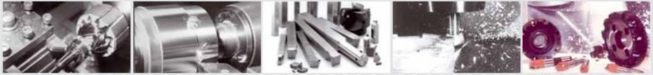
The very first polycrystalline diamond tools – Examples (1973 – 1974)