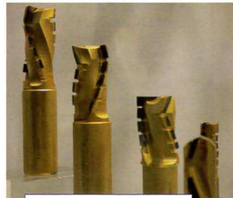
The Eighties: PCD High speed milling cutter with offset cutting edges.