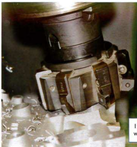
1974: First milling of aluminium with PCD cutters.

LACH DIAMANT shows the rotation spark erosion machines »EDG-plus«, at first developed for its own use, for the service of all PCD tools for the wood and plastics industry.