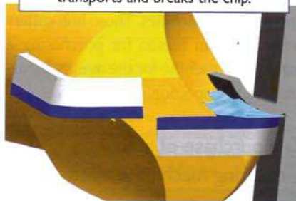
2010/12: Cool Injection takes effect on the chip without loss of the PCD cutting edge. Cool Injection cools, lubricates, transports and breaks the chip.