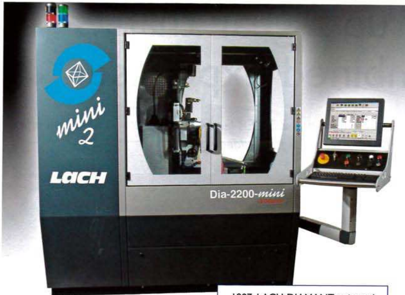
1987: LACH DIAMANT universal sharpening machine Dia-2200-mini.