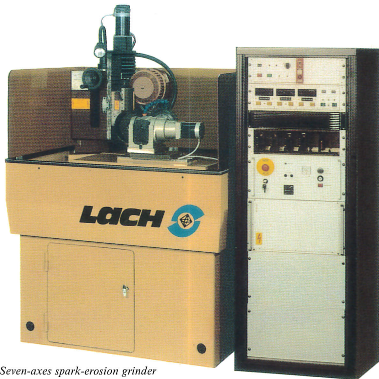
Fig. 2: Seven-axes spark-erosion grinder